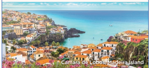
Camara de Lobos, Madeira Island